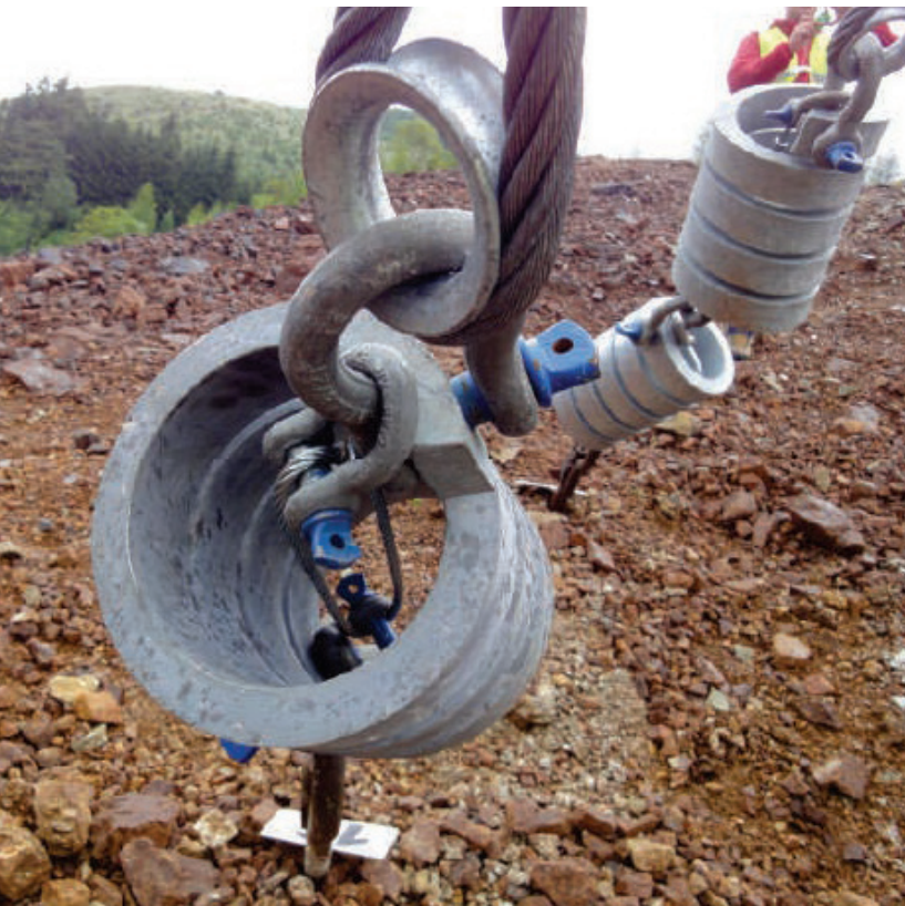
Several adaptations are made to a standard catchment fence to reduce maintenance such as the brake locks pictured above.