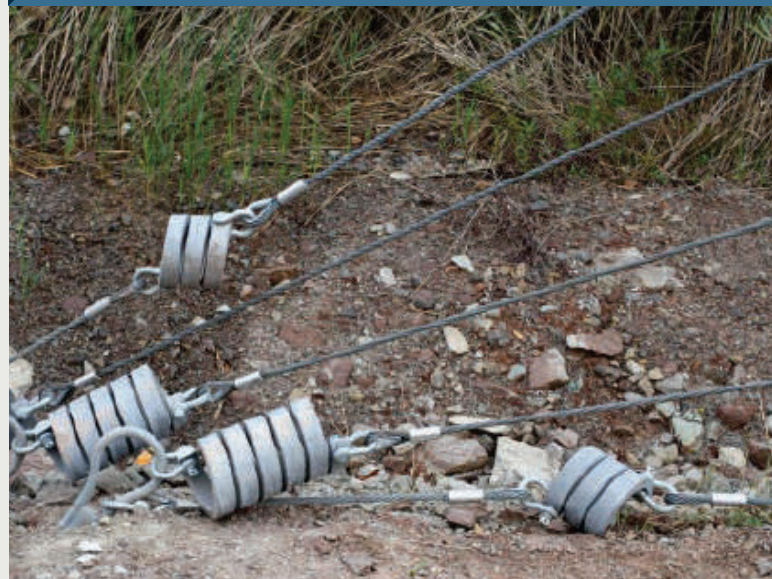
Brake elements are only found at the extremities of a system, directly at anchor points. All brake elements are connected with shackles to the ropes and can be easily changed. In this example, brake elements consist of large steel coils that unwind during impact.

The design procedure is an ever-evolving process. It is not just limited to the design team, but also includes constant feedback from our clients, and also contractors who install the systems and evaluate the performance of the systems in the field. It is only through such an interactive process that a high value product can be created.