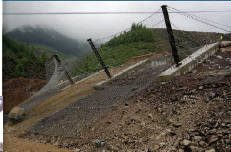
During the impact, the majority of the energy is absorbed during the initial contact with the upper section of the structure, but the projectile is allowed to progress through the system to the bottom portion of the net.