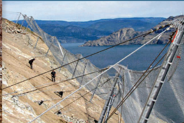
A lower energy attenuator system composed of High Performance Netting in combination with standard hinged posts and base plates.